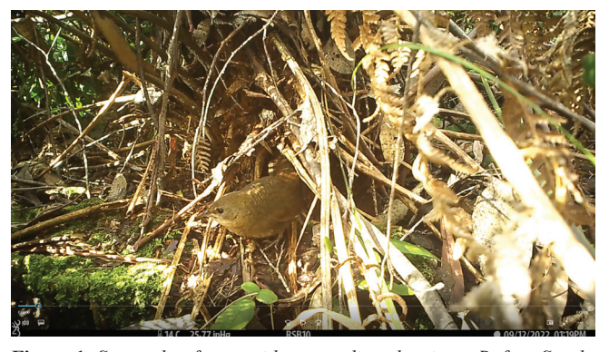
Figure 1. Screenshot from a video recording showing a Rufous Scrubbird moving through vegetation in Territory 2.

Initially I programmed the cameras to operate 24 hours per day (when triggered by movement). However, as that yielded numerous images and videos of nocturnal animals, I changed the settings, firstly to record from \sim 30 minutes before dawn to \sim 30