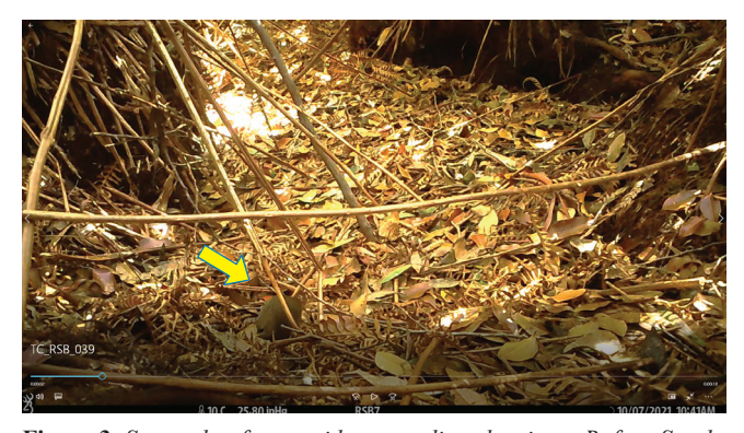
Figure 3. Screenshot from a video recording showing a Rufous Scrubbird (arrowed) in Territory 1 foraging on the ground, using its bill to probe the leaf litter.