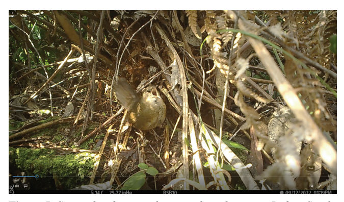
Figure 5. Screenshot from a video recording showing a Rufous Scrubbird vocalising in Territory 2.

four of these instances and consequently the video recordings of these unbanded scrub-birds were in black-and-white. Therefore it was not possible to draw conclusions about the sex or age of any of these birds, except that they were not adult males, as they lacked black breast and throat plumage.