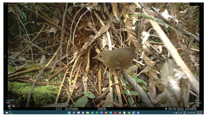
Figure 2. A second screenshot from a video recording showing a Rufous Scrub-bird moving through vegetation in Territory 2.

minutes after dusk, and later to record from \sim 1 hour after dawn to \sim 1 hour before dusk. Ambient lighting was usually brighter in the latter time slot, and as a result the video recordings were of better quality and were more likely to yield useful behavioural information.