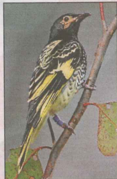
AT RISK: A pretty Regent Honeyeater.